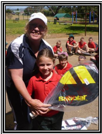
Angel & Birdie