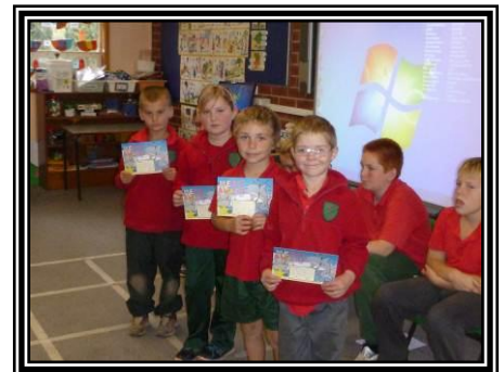
Year 2 Class Award winners