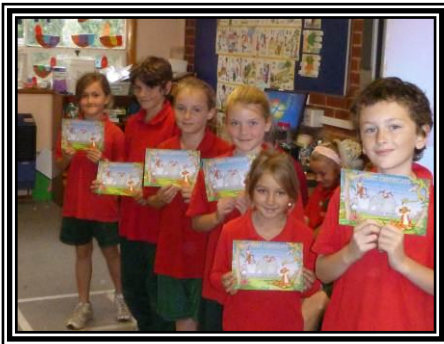
3/4/5 Class Award winners