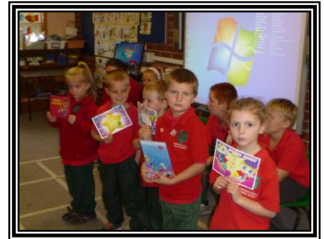
K/1 Class Award winners