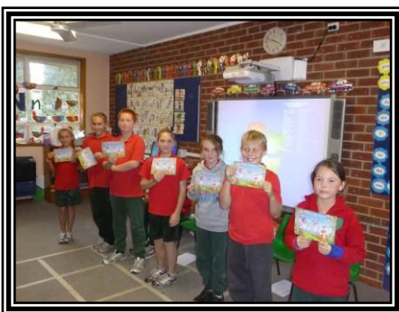
4/5/6 Class Award winners